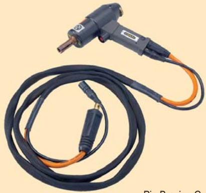
Pin Brazing Gun