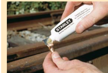
3. Apply Flux