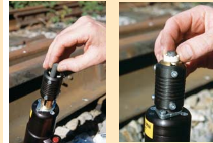
2. Install Electrode and Ring