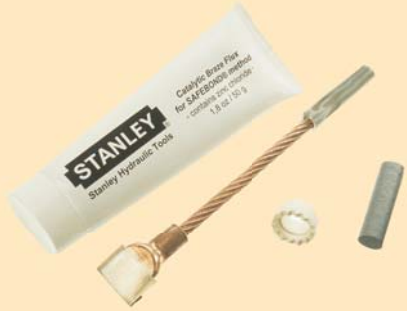
Flux tube, bond, ceramic ring and electrode

The patented Stanley Pin Brazing System installs bond quickly and safely. The bonds can be installed in less than two minutes under any weather condition. The rugged bonds have a high mechanical strength as well as a low transition resistance to stand up to the rigors of the railway. The bonds have been a cost-effective choice for many railways for over 30 years.