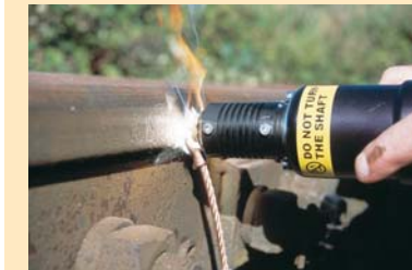
4. Pull the Trigger