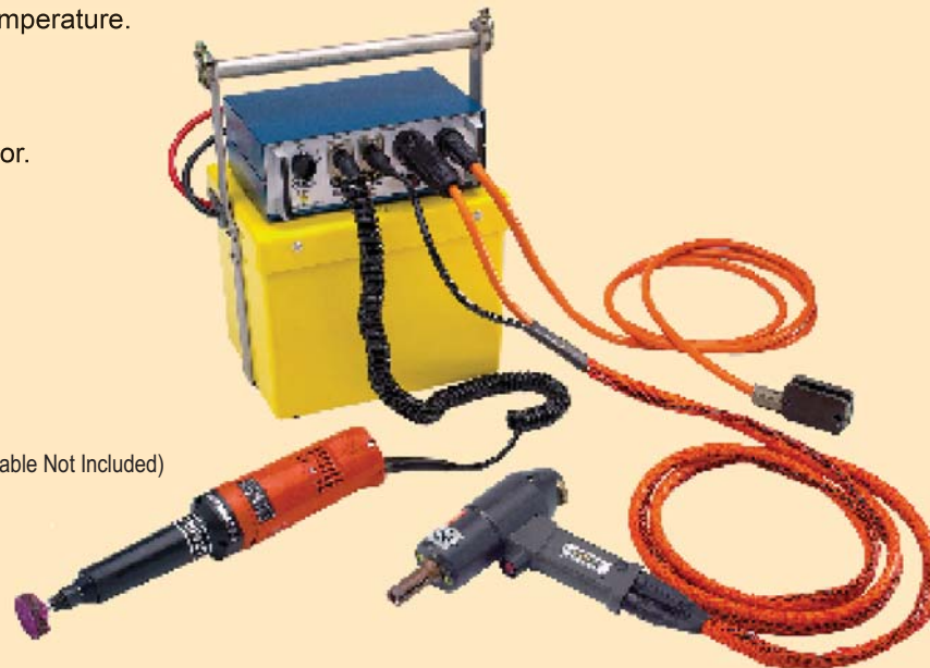
EP30 Pin Brazing Unit (Gun, Grinder, Earthing Cable Not Included)